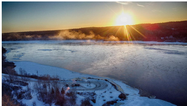
Exploits River, Grand Falls-Windsor NL