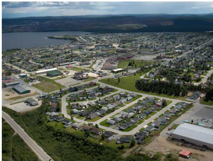
Labrador City, NL