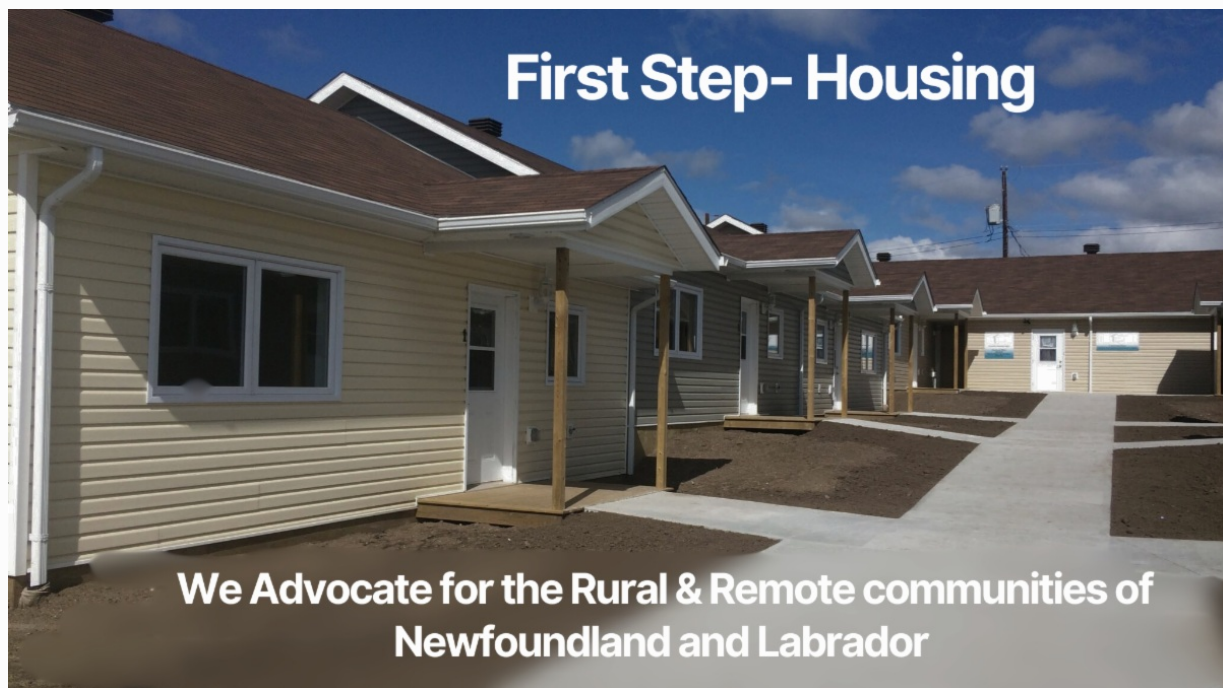
Labrador West Housing and Homelessness Coalition units