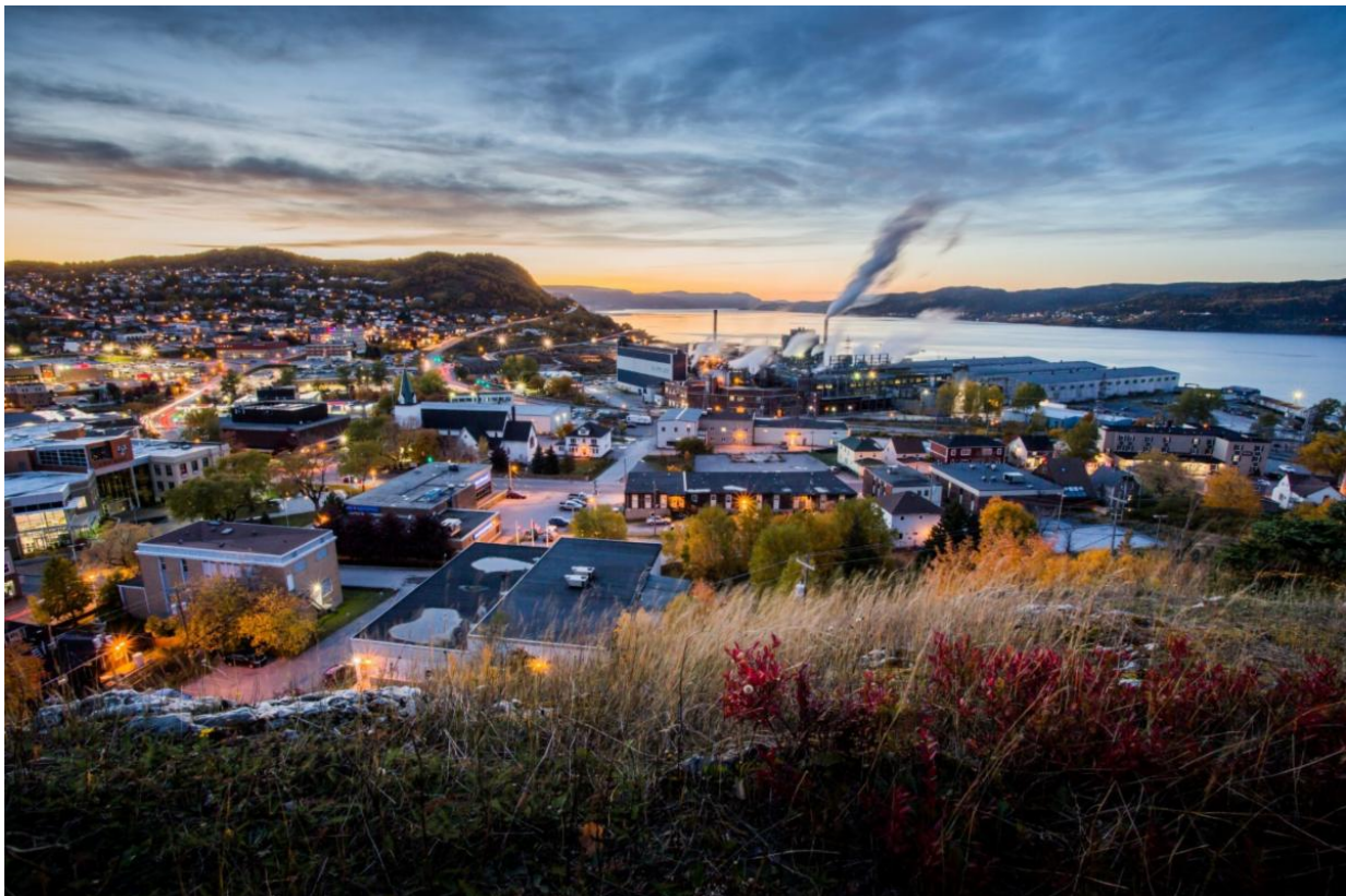
Corner Brook, NL