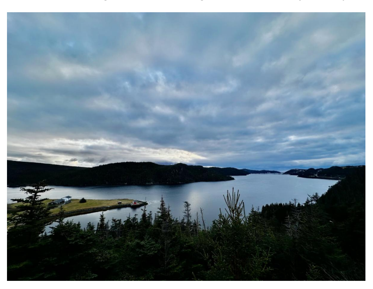
Placentia, NL Taken January 15th during a visit to the Community Connections Housing Coalition

"Affordable housing isn't a benefit; it's a right, the foundation of a just society"